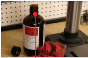
Violation: Open containers are not approved and allow VOC's into the air