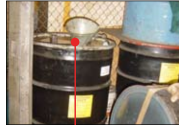
Violation: Not compliant safety funnel or drum lid