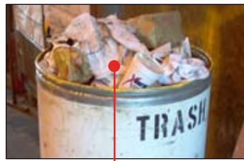
Violation: Fluid soaked wipes in open trash cans