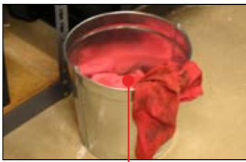
Violation: Fluid soaked rags are a fire hazard