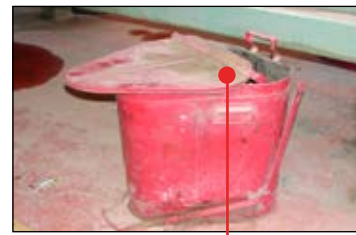
Violation: Inoperable oily waste cans