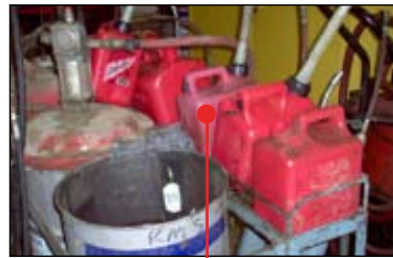
Violation: Not approved "Safety Cans"