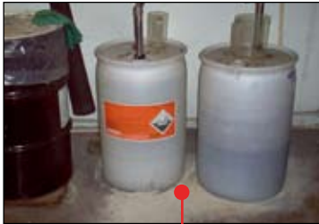
Violation: No ground spill protection