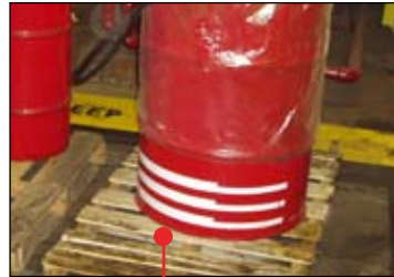
Violation: Not compliant spill pallet